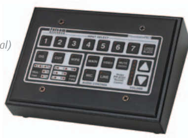
PP-0701 Presentation Controller (optional)

The optional PP-0701 Presentation Controller allows remote operation of PresentationPRO. For more information on this controller, please contact us.