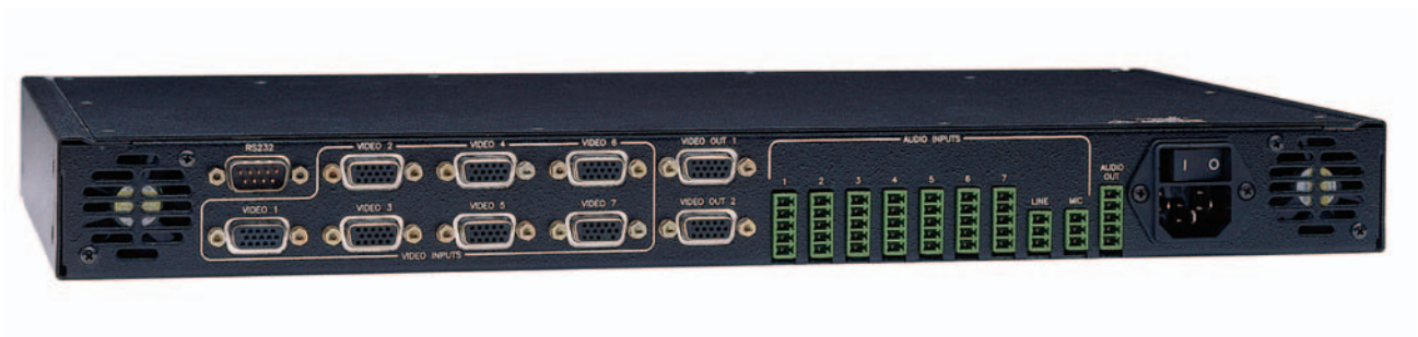
PresentationPRO Rear Panel